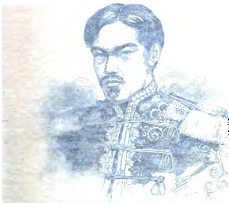
Emperor of Japan.